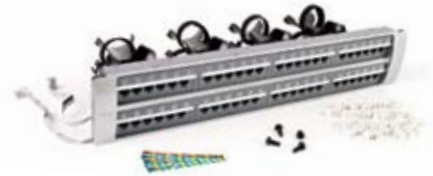
SYSTIMAX 360 iPatch 1100GS6 Evolve Panel, front