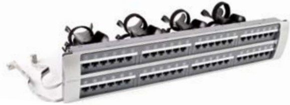
SYSTIMAX 360 iPatch 1100GS6 Evolve Panel, 48 Port

The passive components in the panel qualify for the same SYSTIMAX Structured Connectivity Solutions 20-year Extended Product Warranty and Applications Assurance as standard SYSTIMAX copper panels when included in a certified SYSTIMAX PowerSUM, GigaSPEED XL or GigaSPEED X10D channel. The active components, including the patch panels’ tracing and sensing modules, are covered by the SYSTIMAX iPatch System Active Components 3-year Product Warranty.