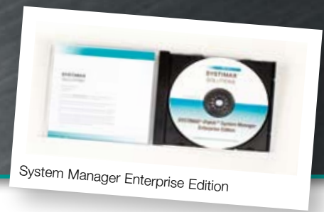
System Manager Enterprise Edition