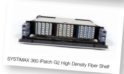
SYSTIMAX 360 iPatch G2 High Density Fiber Shelf