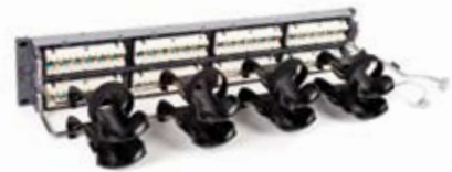
SYSTIMAX 360 iPatch 1100GS6 Evolve Panel, rear