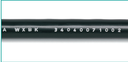
Example: WebTrak # on Fiber Optic Cable