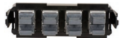
SYSTIMAX 360G2 Adapter Panel

Note it is highly recommended to use the fiber cord management sleeves for UHD installation.