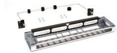
360 1U Modular Panel