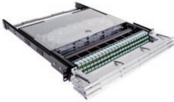
3603D-1U-UP w(3) 3603M-48LC-LS A