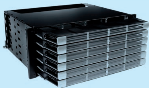
SYSTIMAX 360G2 Ultra High Density Fiber Shelf (760154344)