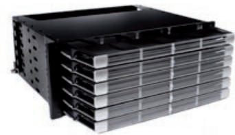
InstaPATCH 360G2 4U UHD Shelf