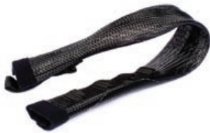
CMS-2-02 Fiber Cord Management Sleeve