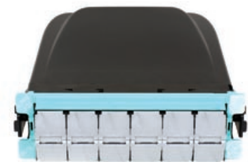
InstaPATCH 360 Module