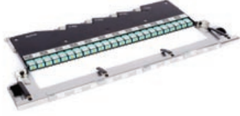
InstaPATCH 360 UHD Module 48f LC LazrSPEED